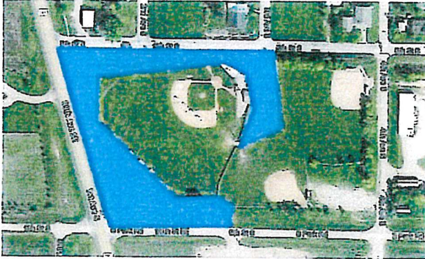
Area A - area shaded Mow & Trim